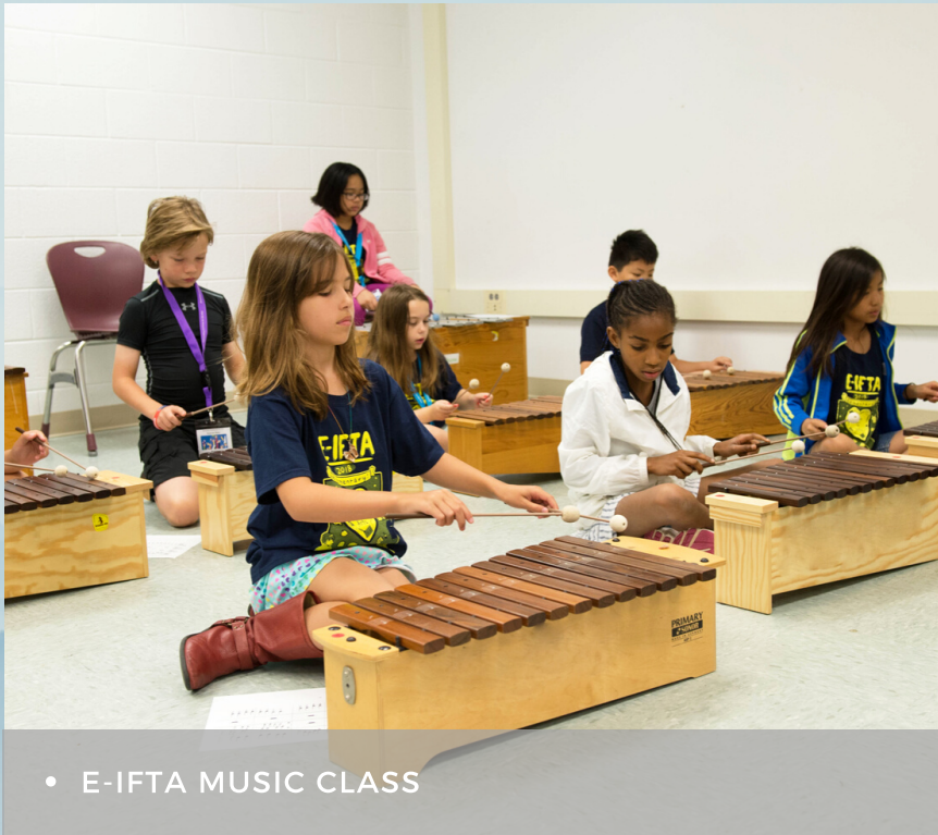
• E-IFTA MUSIC CLASS