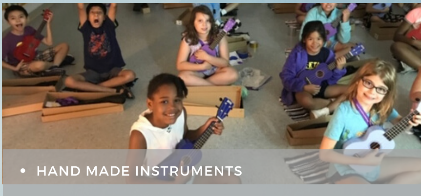
• HAND MADE INSTRUMENTS