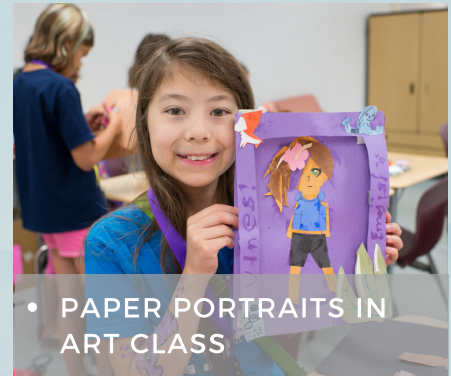
• PAPER PORTRAITS IN ART CLASS